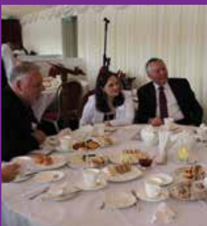
Terry Waite enjoys tea

“Everyone at the Trust works pro bono. Along with our guests, we have some of our Advice Line Team here. All of them are either parents of young people with ME, or people who've had to cope with ME themselves. That's because it's so important, when people call us, that they have confidence in