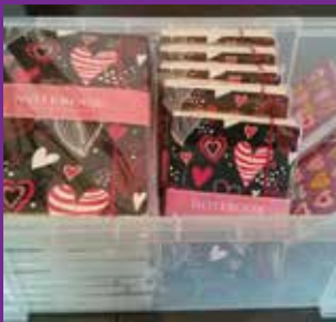
Young Hearts Day gifts

We lit a real candle and posted the photo: on Twitter @JaneCColby, @tymestrust and on our Facebook page facebook.com/tymestrust This is an open page that anyone may view.