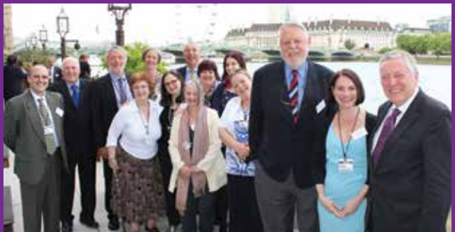
Tymes Trust volunteers and patrons at the House of Lords