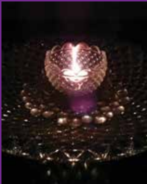
Tymes Trust's Young Hearts Day candle.

We lit a real candle and posted the photo: on Twitter @JaneCColby, @tymestrust and on our Facebook page facebook.com/tymestrust This is an open page that anyone may view.