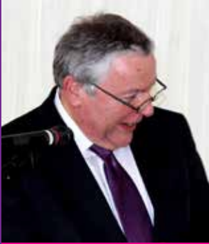
Lord Clement-Jones CBE

Hosted by the Lord Clement-Jones CBE, Tymes Trust Founder Patron, and held with Nisai Learning in June, our 25th Anniversary month.