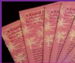
The Good Practice Guide to Education for Children with ME

Ben Burgess and Isla Kidd star on our latest poster: 'No, you don't know best' and '25 years of Trusting Tymes'.