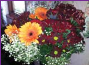
Flowers to thank us

It's that time of year again. I am happy to be setting out another encouraging Tymes Tidings! Here are some of the many people who've been involved with the Trust this year.