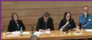
Question Time panel in Oxford