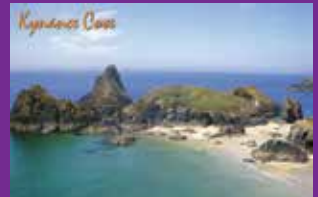
Summer holiday at Kynance Cove

The OMEGA host group in Oxford writes: 'We would like to thank you for your valued contribution to MEA Question Time. Many people said they enjoyed the event and found it very interesting. It was lovely to see you; thank you for giving up your time and energy to give us the benefit of your knowledge and experience, which was much appreciated. Thank you also to those people who assisted you, both beforehand and on the day, or who gave up their time in other ways.'